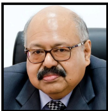
Hon'ble Mr. Justice Hrishikesh Roy Former Judge Supreme Court of India